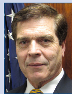
MAYOR ALAN BEACH